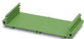
The illustration shows the variant UM 45-Profil CM

Drawn section panel mounting base, with a constructional width of 108 mm and a fixed length of 100 cm