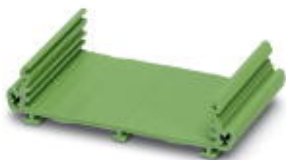
The illustration shows the variant UM 45-Profil CM

Drawn section panel mounting base, with a constructional width of 72 mm and a fixed length of 100 cm